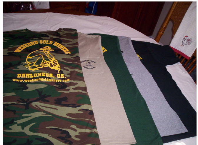
Mens Shirt Colors: Black, Tan, Grey, Hunter Green, Camo Sizes: Small, Med., Large, X-Large, 2X. Camo shirts do not have a pocket.