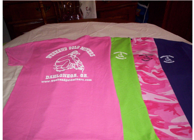
Ladies Shirt Colors: Pink, Green, Purple and Pink Camo. Sizes: Small, Med., Large, X-Large and 2X.

These are the new WEGM T-shirts for the men and ladies. All shirts are $10.00 ea. There will be a $6.50 shipping and handling charge for each shirt. If you want to place an order please state the color and size of shirt and how many. Send your order to: T-Shirt Order. P.O. Box 910, Dahlonega, Ga. 30533. Make check or money order to Weekend Gold Miners Club.