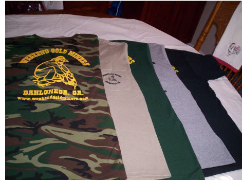
Mens Shirt Colors: Black, Tan, Grey, Hunter Green, Camo Sizes: Small, Med., Large, X-Large, 2X. Camo shirts do not have a pocket.

These are the new WEGM T-shirts for the men and ladies. All shirts are $10.00 ea. There will be a $6.50 shipping and handling charge for each shirt. If you want to place an order please state the color and size of shirt and how many. Send your order to: T-Shirt Order. P.O. Box 910, Dahlonega, Ga. 30533. Make check or money order to Weekend Gold Miners Club.