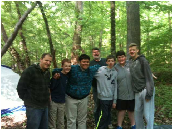
BSA Troop 4 Kennesaw