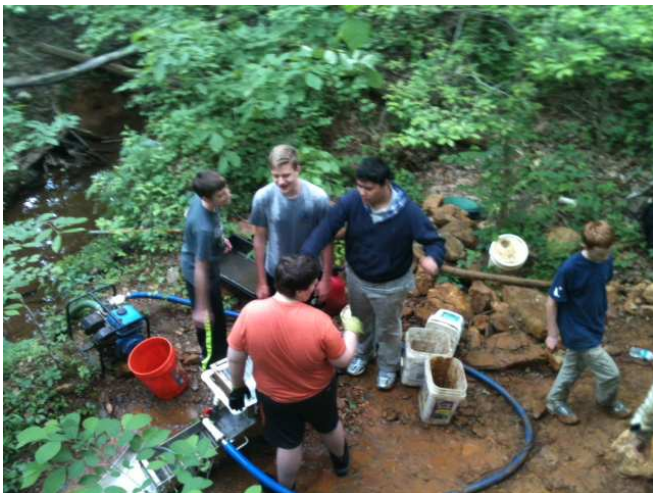
BSA Troop 4 Kennesaw