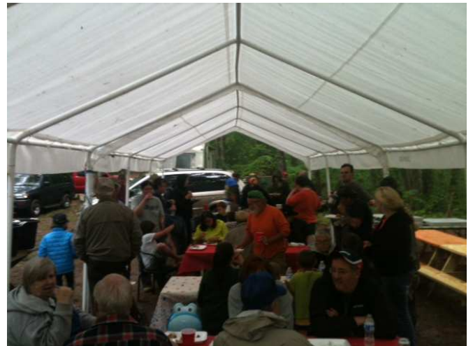
June Common Lunch