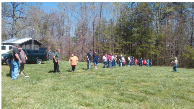
April Hunt Photo