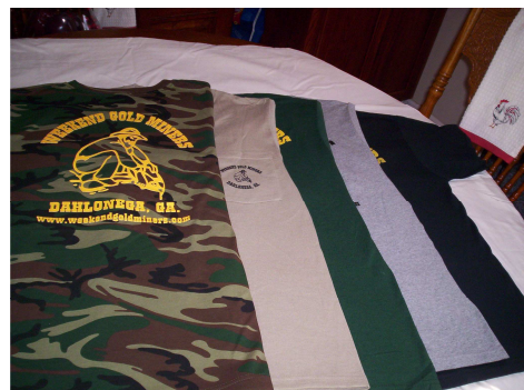
Mens Shirt Colors: Black, Tan, Grey, Hunter Green, Camo Sizes: Small, Med., Large, X-Large, 2X. Camo shirts do not have a pocket.